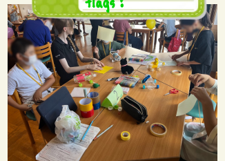
So many colorful flags!