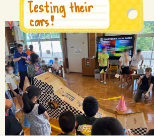
Testing their cars!