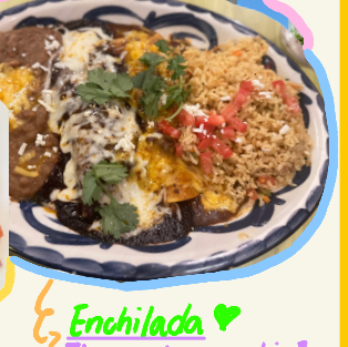
Enchilada! This meal was so big!