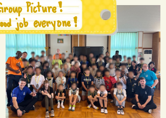
Group Picture! Good job everyone!