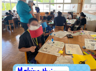
Making their original flags!

Shoutout to Ohara ES students for a job well done. Keep up the good work!