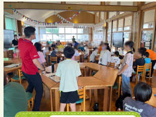
Listen to the teacher!