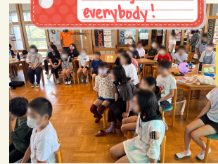
Getting to know everybody!